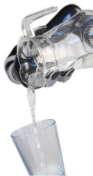
Figure 6 : Pouring motion of JACO

Most of JACO users drink with a straw. However, for those who wish to drink directly from a glass or to pour a drink, a combination of upward and backward translations in addition to wrist rotation are needed to assure proper positioning of the bottle. While humans easily perform this motion, it is a complex motion to perform with a robot. To overcome this barrier, an automatic synchronization of the drinking motion was designed. The drinking mode algorithm shifts the center of rotation of the gripper in height and radius. This allows setting the bottle at a single position near the mouth and performing the drinking motion very easily by activating the wrist rotation. The motion of drinking and pouring are very similar (Figure 6) and both tasks may be enhanced by activating the drinking mode.