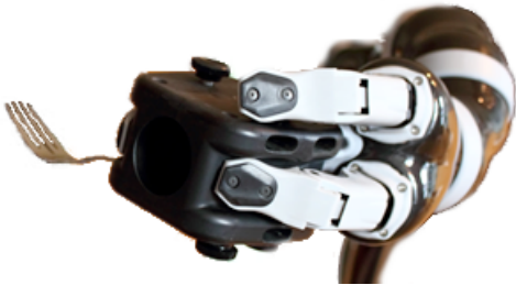
Figure 5. Minor adaptation to everyday objects

Many strategies may be used to insure intuitive and efficient use of the assistive device such as design, training, tools and adaptation to everyday objects (Figure 5). This section presents robotic algorithms designed for specific users' needs. These additional functionalities aims to enhance the users' autonomy by increasing the number of achievable tasks and diminishing the time and effort needed to achieve them.