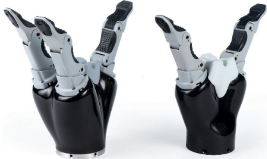
Figure 3 : Kinova's grippers: KG-3 and KG-2.

The device can be equipped with a three or a two fingers gripper. The three fingers gripper allows opening and closing of either two fingers (index and thumb) to pinch a fine object (such as a straw or a pen) or three fingers to assure better grasp of a larger object. The three fingers gripper main advantage is that it allows a stronger grasp while the two fingers gripper is less cumbersome. The best solution depends on the users specific needs.