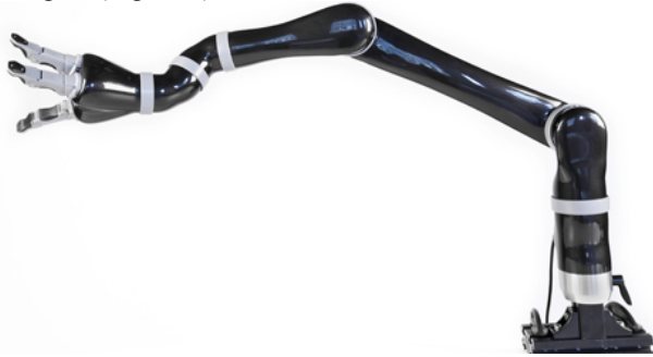
Figure 2 : JACO 6 degree of freedom version.

A Cartesian controller automatically coordinates the actuators in order to procure intuitive motions to the user. The Cartesian controller allows 8 basic movements: 3 translations, 3 rotations of the wrist and opening/closing of the fingers (Figure 2).