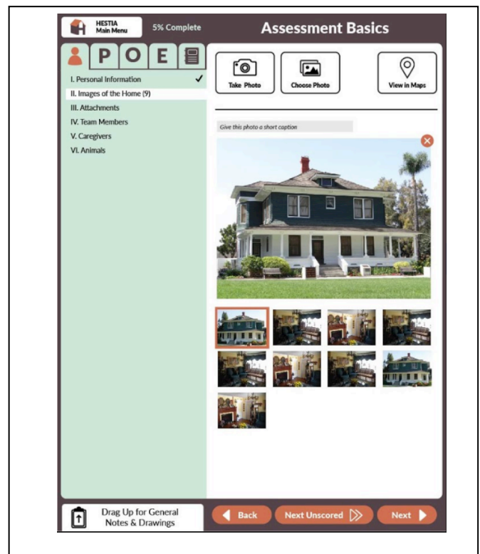
Figure 2: High Fidelity Mock-Up Designed with Multidisciplinary Stakeholder Input

End user/stakeholders will participate in user interface testing and focus groups to offer input on final design features and functionality. Focus group findings will support another iteration of content and design development. After final content and design decisions have been made for HESTIA, the Design/Technology Team will have frequent and consistent meetings with the Programming Team to ensure the final product will be usable and valuable to end-users. The Content Team will focus on developing app testing protocol and reliability/validity testing.