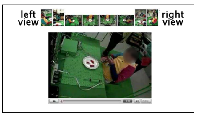
Figure 1: Video of a stroke survivor performing a task on the AMAT. Therapists were allowed to view each task from eight camera angles.

Three expert occupational therapists were then asked to assess the stroke survivors based on the video recordings. All participating therapists were certified and licensed with at least 10 years experience in neurorehabilitation after stroke. Two had AMAT specific training, and all had at least basic familiarity with the tool.