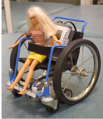
Figure 1: Lego mindstorm robot and participant's toy on a toy wheelchair

First, basic functions to establish wireless communication between the robot and the SGD were developed. Second, basic functions to move the motors were developed so that its speed, direction, and the amount of rotation could be controlled. Third, a page for robot control (Figure 2) was designed in the SGD, which consisted of four icons: go forward, go backward, turn right, and turn left. Fourth, a function, which sends a command to the next opened window, was programmed in an advanced programming page in the SGD. Fifth, a program that parses the input command and executes the desired operation was developed in the Microsoft Visual C# 2010. This program receives input from the robot control page and sends the appropriate command to the robot via Bluetooth.