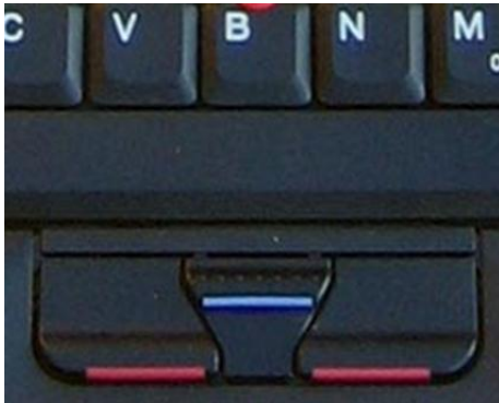
Figure 3: Lenovo ThinkPad has a magnifying key between the left and right click keys

Lenovo ThinkPad computers have a third key between the left and right mouse click keys (Fig. 3). It has options for setting the size of the area to be enlarged, as well as the amount of magnification desired.