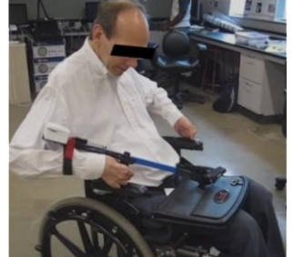
(d) X places the cell phone on his lap and then commands the gripper to open releasing the cell phone