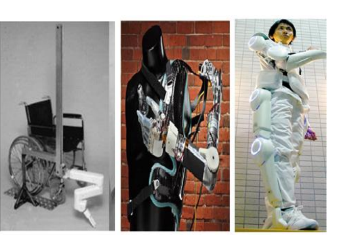
Figure 1: Showing different assistive devices