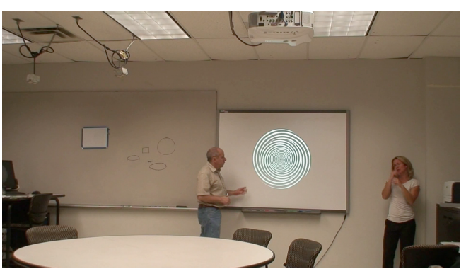
Figure 3: Rewinding a video to the previous slide

We recorded and streamed a lecture using smart phones. The reason for picking smart phones is because they have built in video cameras and can capture and stream video. The popularity of smart phones has surged, and now constitutes a majority of new phone purchasers [8]. We chose to record and stream a two minute long lecture about the human visual system. We chose this specific kind of lecture because it is not very technical, yet is highly visual. We presented this lecture in two different ways to the students. In the first approach, the instructor simultaneously spoke while referring to information on the slides. We recorded and streamed the lecture slides, and also recorded the sign language interpreter close up.