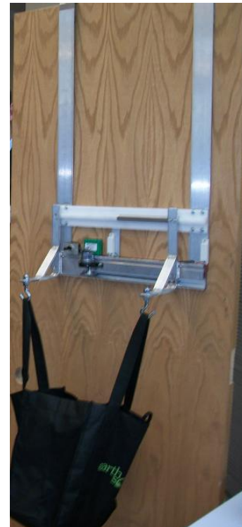
Figure 4. Close up view of the unit.