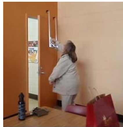
Figure 1. Client setting-up the Hanging Bag Assistant

need for a device to assist her with the process of packing various sized bags. After searching the United States patent and Trademark database [1] and multiple consumer websites, it was determined that such a device does not exist in the market.