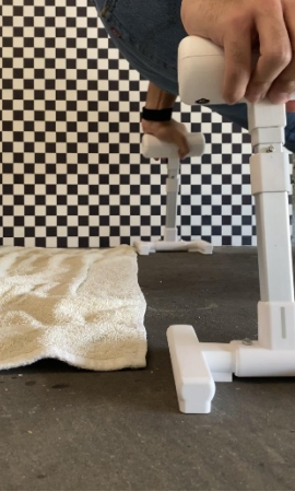
Figure 7: Displacement testing with Assist Handles