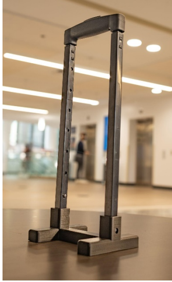
Figure 1: First iteration of the device with suitcase handle and 3d printed base

For the second round of interviews, twenty-seven qualitative solution interviews were conducted with licensed therapists specializing in wheelchair mobility and rehabilitation. The purpose of such interviews was to solidify an approach to creating the ideal device for the end users and early adopters. Device customization was the primary input that was received through conducted interviews with the therapists. Due to the variation in each person's mobility and upper limb capabilities, the device needs to be either adjustable or customizable to meet the user's preferences.