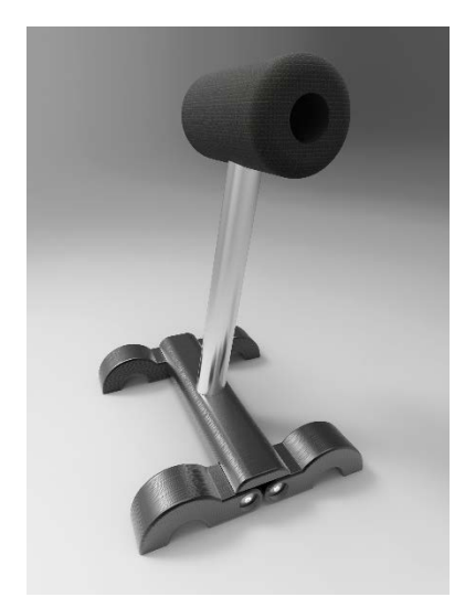
Figure 3: The Assist Handle in the assembled state