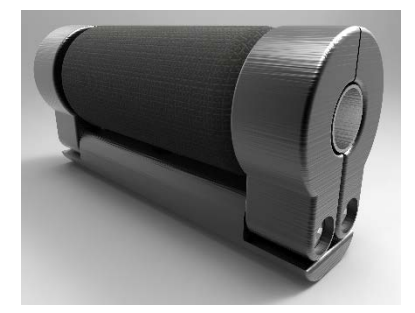
Figure 4: The Assist Handle in the portable state

steel. The device consists of an assembly mechanism that allows the user to assemble and disassemble the handle in the matter of seconds. To assemble the device, the base is unfolded and taken off of the handle. The shaft is then removed from within the handle and subsequently attached to the handle and base through a threaded connection.