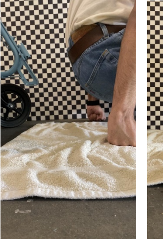
Figure 6: Displacement testing without Assist Handles

First, each participant was asked to lay on the ground parallel to the grid board, with their legs lying flat on the ground. The participants would then attempt to lift themselves up as high as they can by pushing on their hands and continuously keeping their legs flat, as shown in Figure 6. The same process was repeated a total of 30 times. The second round of the displacement testing required the participants to repeat the same steps as the first, but while using the Assist Handle, shown in Figure 7. The maximum hip displacement for each attempt was recorded using video capturing software. Through the acquired results, the use of the Assist Handle increased the maximum hip height by a mean of 12.5 inches.