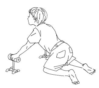
Figure 5A: Sideways floor transfer performed with the Assist Handle

In its disassembled state, shown in Figure 4, the device has a relatively cylindrical shape, allowing for efficient storage while not in use. Through a universal snap fit mechanism as well, the Assist Handle can easily be attached to the side of most manual wheelchairs, making the device easily accessible to the user when necessary.