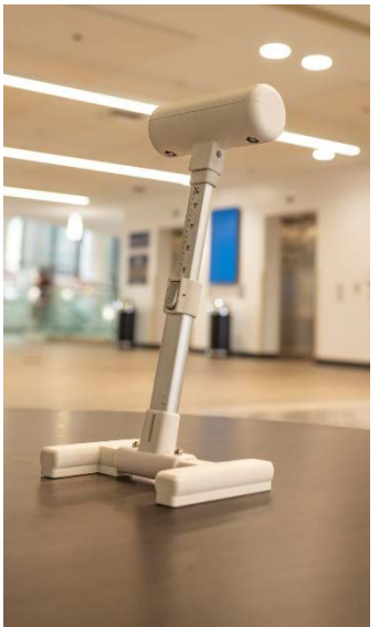
Figure 2: Second iteration of the device with cylindrical 3d printed bar

To test device capability, the first iteration of the device consisted of a suitcase handle attached to a solid 3Dprinted base, shown in Figure 1. Additional holes were added into the shaft portion of the handle for height adjustability. The second iteration, Figure 2, included similar parts to the initial design, except the handle was changed to a cylindrical bar to allow for a better grasp and distribution of weight while transferring. The second prototype was also successful in regards to functionality; however, it was not compact and portable as previous validation testing deemed it necessary.