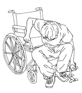
Figure 5B: Rear floor transfer performed with two of the Assist Handles