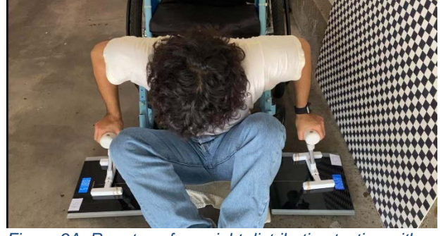
Figure 9A: Rear transfer weight distribution testing with the Assist Handle